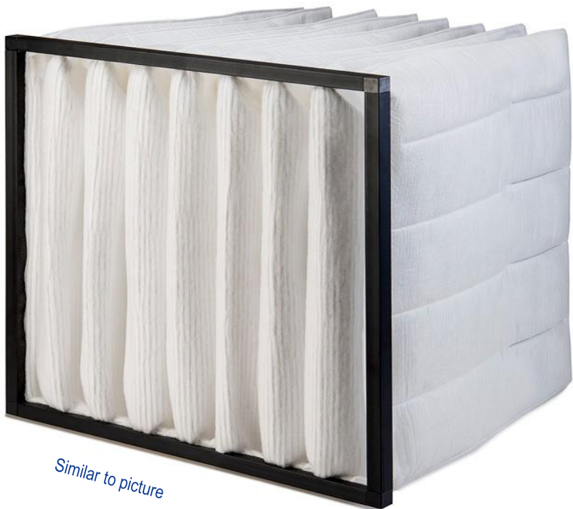
Similar to picture